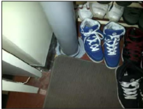
PHOTO 119 - UNIT G3 - SUCTION POINT