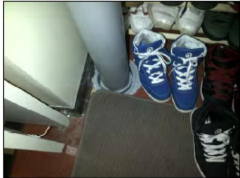
PHOTO 119 - UNIT G3 - SUCTION POINT